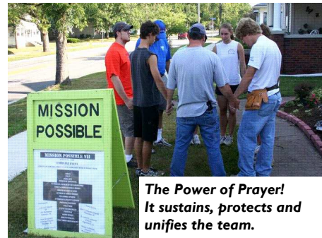
The Power of Prayer! It sustains, protects and unifies the team.

I found myself delighting in the company of both the people I was serving and the people around me during my trip. By weeks' end I realized that this was the kind of thing that makes your faith grow stronger, seeing the joy of Christ in the eyes of everyone was a very moving experience.