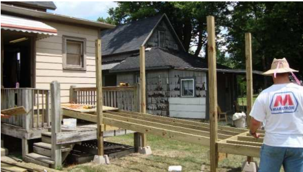
Part of a wheelchair project