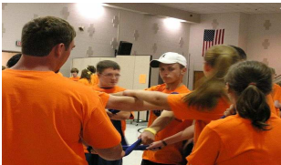
Playing games after working all day.