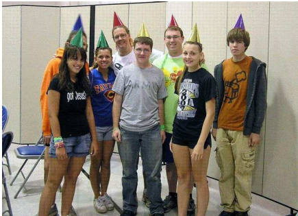
Another youth celebrates her birthday by serving others.