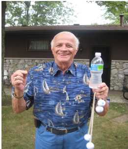
Theirs is always fun at Mission Possible! Here’s one volunteer’s scavenger hunt find-